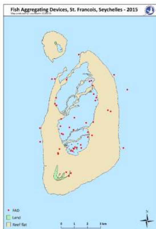
Figure 2. Locations of DFADs found in 2015 during a systematic survey of St. Francois atoll, Seychelles.

In 2015 data collection methodologies were reviewed and a database of all DFAD beaching events was created. Data collection parameters were chosen in order to determine which fishing vessel/fleet the DFAD came from and the environmental impact caused (Table 1). In April 2015 ICS teams conducted DFAD surveys around St. Francois and Farquhar atolls to determine the number of DFADs currently beached at these locations (Figure 2). A total of 96 DFADs were found during these