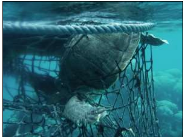
Figure 6. An Olive Ridley Turtle entangled in DFAD netting

compared to 48.9% for DFADs using nets (Figure 7).