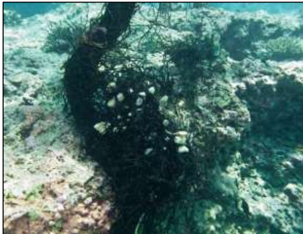
Figure 5. Coral entangled in DFAD netting

DFADs were found to be impacting coral reef more than other habitat zones. 39% of the DFADs were found attached to reef. The netting and ropes of the DFADs becomes caught more easily on corals and once attached rarely drift away again. This was seen particularly in the lagoon of St. Francois atoll, where DFADs are able to cross over the shallow waters of the sea grass flats but once in the lagoon become caught on coral bommies. The construction material of the aggregator was found to be a factor with 23.8% of DFADs using synthetic rope as the aggregator found on coral reef habitat