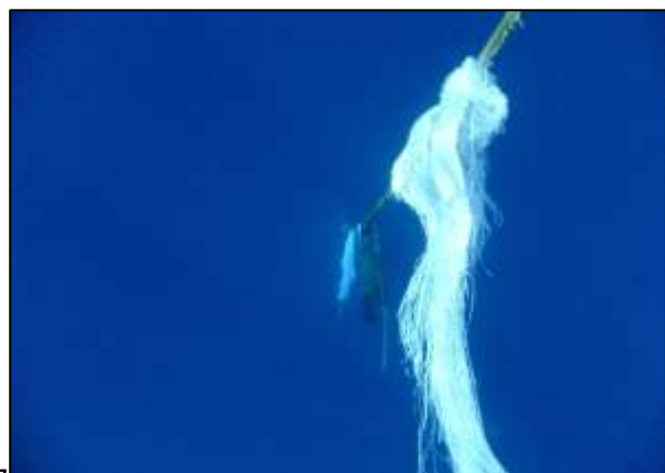
Figure 6. Synthetic rope with salt bags attached