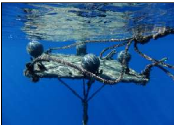
Figure 5. A DFAD constructed without netting

In terms of DFAD construction there was a relatively low proportion (18.4%) of DFADs that had hanging curtain nets as the aggregator. The use of fishing nets rolled up into a sausage (sausage net) was found to be the most common form of aggregator (62.1%). What was apparent was a lack of bio-degradable materials used in DFAD construction. In all the DFADs observed the aggregator components were made entirely of synthetic materials. Of DFADs using curtain nets that could be identified to a vessel 100% were from Spanish companies. Where the aggregator was recorded for