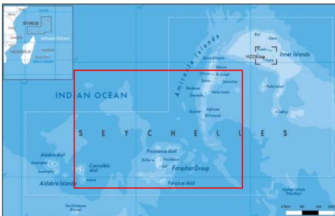
Figure 1. Study site (red box), the Outer islands where DFADs have been recorded.

The meteorology of Seychelles is dominated by two monsoon seasons which are named after the direction of the prevailing winds: the Northwest (NW) monsoon and the Southeast (SE) monsoon. The NW monsoon occurs during the austral summer from November to April and is characterised by light winds (<10knots). The SE monsoon occurs during the austral winter from May to October and is characterised by strong winds (>20knots). It has been observed that a greater amount of marine debris accumulates on the islands during the SE monsoon (Duhec, et al., 2015).